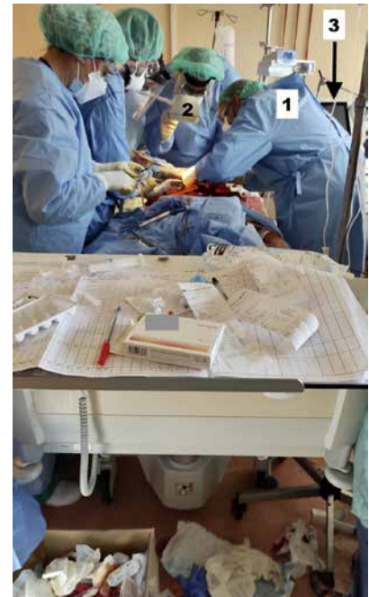
FIGURE 1. The surgical intervention was performed in an improvised intensive care unit with inadequate equipment. The cardiac surgeon (1) is working without surgical loupes, with protective glasses only and under a small source of light (2). The ventilator is turned off (3), and the gas exchange was performed via VV ECMO only

The problems that impeded the management of complex cases in the COVID-19 pandemic were numerous. Firstly, an enormous number of patients requiring intensive care overwhelmed the hospitals, which prompted the reorganization of hospital resources [4, 5]. This resulted in improvised COVID-19 ICUs, with suboptimal equipment [4, 6]. Secondly, owing to the scarcity of adequately educated ICU personnel, many medical professionals were redistributed from their departments to COVID-19 ICUs, as well [5]. Thirdly, notwithstanding the redeployment of medical staff, increased workload, tiredness and exhaustion were important factors in the everyday life of healthcare professionals during the pandemic, additionally reducing their work capacity and endangering their decision-making [4, 6]. Fourthly, the protective equipment required in COVID-19 units in a certain amount impairs communication, diminishing an individual's ability to react adequately in emergency situations, which might be fatal if a misunderstanding happens [7, 8]. Although our patient was in the improvised setting of a COVID-19 ICU, the prompt response of intensive care nurses, intensive care specialists, anaesthesiologists, cardiothoracic surgeons and other medical specialists who were